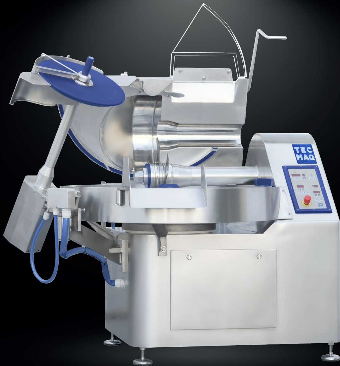
CUT MIX 120